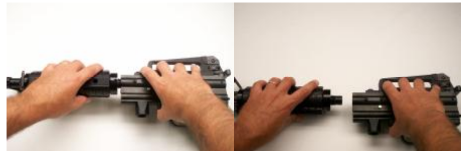
Diagram 1-8: Barrel Removal

A— Begin by unscrewing the barrel from the top body half in a counter clockwise motion as shown. B— After the two have been unscrewed pull them apart as shown in Picture 'B'