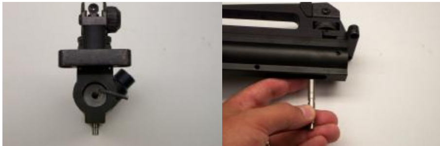
Diagram 1-5: Loosening the connector pin retaining screw. Removing the connector pin and bolt.