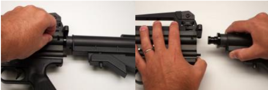
Diagram 1-1: Removing the stock.

A—Loosen stock retaining screw (part #19) With a 3mm Allen Key B—Remove stock by pulling towards the direction shown.