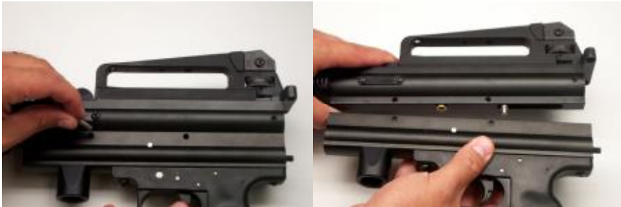
Diagram 1-2: Separating the two Body Halves.

A—Squeeze gun body together and pull out the body pins (part #14) B—Pull the two body halves apart as shown in picture 'B'