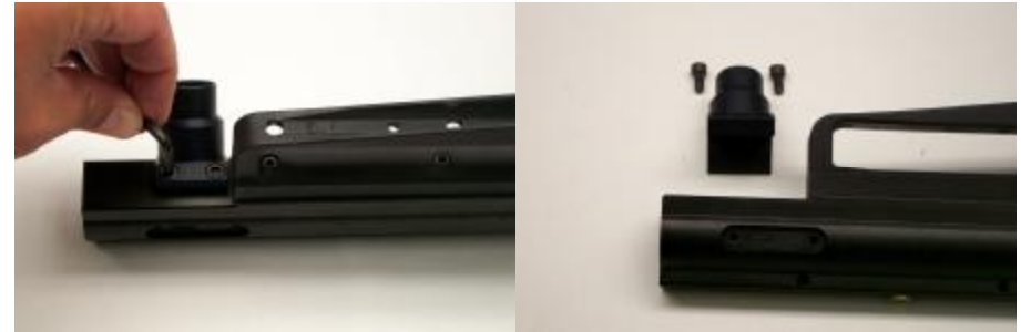
Diagram 1-7: Removing the Feed.

A— Begin by removing the Feed Screws (part #7) with a 4 mm Allen Key. B— Pull up to remove as shown in Picture 'B'.