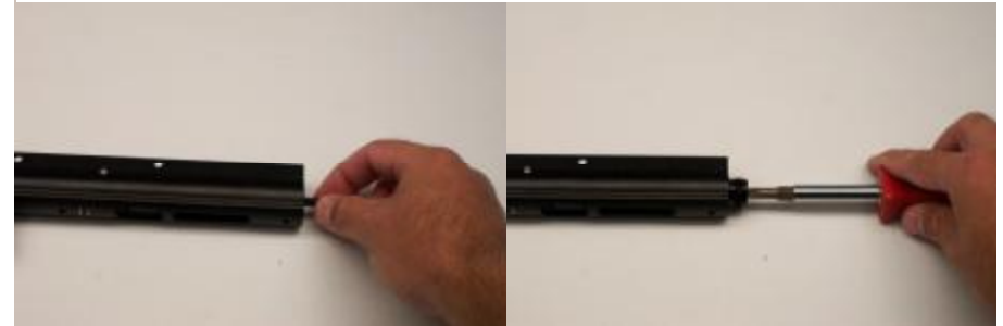
Diagram 1-3: Removing the velocity screw, velocity lug, guide pin, and velocity spring Continued.

B—Loosen and remove velocity screw (part# 27)