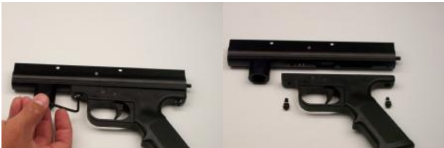
Diagram 1-3: Removing the velocity screw, velocity lug, guide pin, and velocity spring.

A and A1—Begin by removing the trigger assembly screws (part #55) with a 3mm Allen key on the front and rear of the trigger assembly. The bottom body half and trigger assembly will now come apart as shown on picture A1.