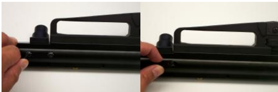
Diagram 1-6: Removing the Ball Detent.

***NOTE: DO NOT loose this copper passage (part #12) without this piece your marker cannot generate enough pressure to fire correctly.***