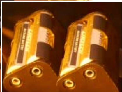
AAA BATTERY PACKS